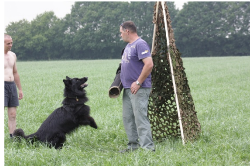
Kazak holding the "protected steward" after "quartering" the field