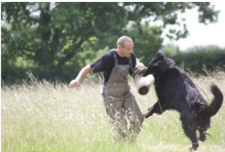
Kazak catching the "protected steward" after a pursuit.